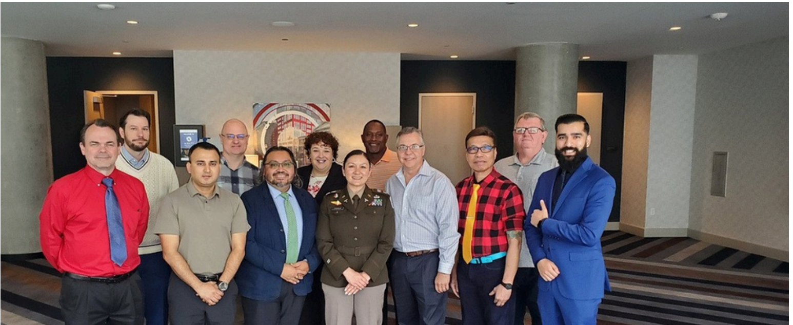
May 2024, CleanMed in Salt Lake City, Utah. DHA Sustainability Team and attendees.