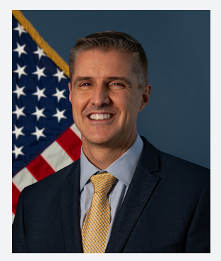
edition of The Scope. I am thrilled to report that we successfully went live with MHS GENESIS to the Federal Health Care Center, our final DOD site. MHS GENESIS is now live at all garrison DOD hospitals and clinics, including 138 parent MTFs. It now reaches over 190,000 active users.