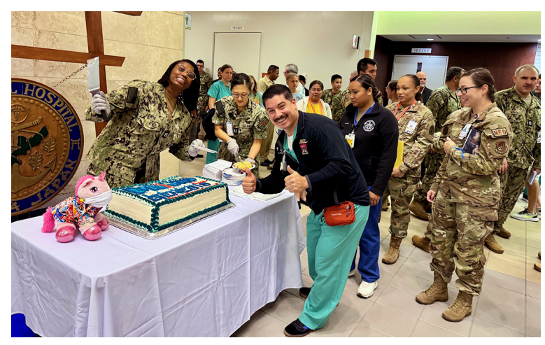
U.S. Naval Hospital Okinawa staff gathered to celebrate MHS GENESIS Go-Live.