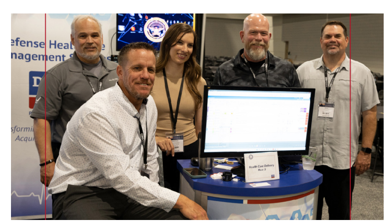
The Health Care Delivery Role 3 team exhibited the MHS GENESIS Theater solution.

JOMIS demonstrations received enthusiastic feedback and curiosity, especially about MedCOP and how health care delivery solutions will support global health operations and force health protection while operating in disconnected, intermittent and limited/low-connectivity environments.