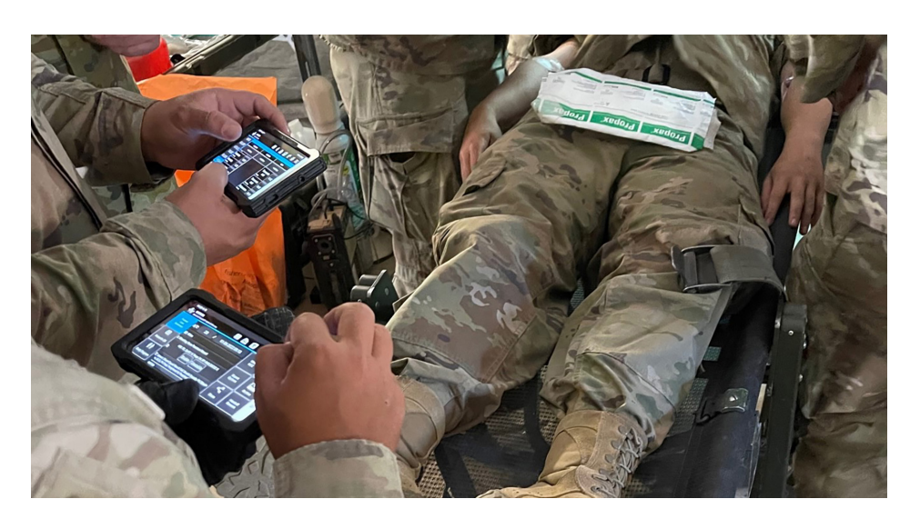
Battlefield medics use BATDOK^{TM} to record point-of-injury patient data.

Read the full interview on how health professionals use data-driven command and control on the battlefield.