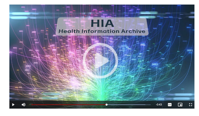
Watch the video for more information about the power of the MIP and HIA.

began as a project known as the Legacy Data Consolidation Solution to support DHMS deployment plans, legacy system decommissioning plans and operations and sustainment activities.HIA gives DHA the ability to identify, capture, organize, disseminate and synthesize legacy data needed to support business intelligence and continuity of care.