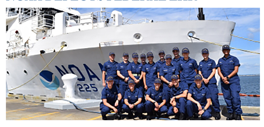
Commissioned Corps officers pose in front of NOAA Ship Henry B. Bigelow.

The Department of Commerce's National Oceanic and Atmospheric Administration deployed MHS GENESIS to its sites on June 3, going live simultaneously with Wave WRIGHT-PATTERSON. NOAA became the fourth federal agency to adopt the federal EHR, joining DOD, VA and the U.S. Coast Guard. NOAA's Office of Marine and Aviation Operations will use MHS GENESIS for 300 Commissioned Corps officers and 400 divers operating research and survey ships and aircraft.