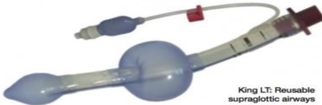
King LT: Reusable supraglottic airways