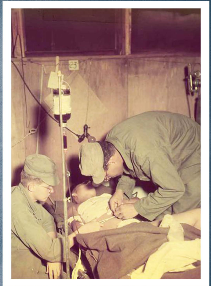
BLOOD TRANSFUSION AT MOBILE ARMY SURGICAL HOSPITAL (MASH) UNIT IN 1950S

The ASBP has a mission of readiness. We are tasked with equipping service members in the heart of battle with the blood products they need, wherever and whenever they need them. Anyone receiving blood far forward and deployed to areas known and unknown is through us.